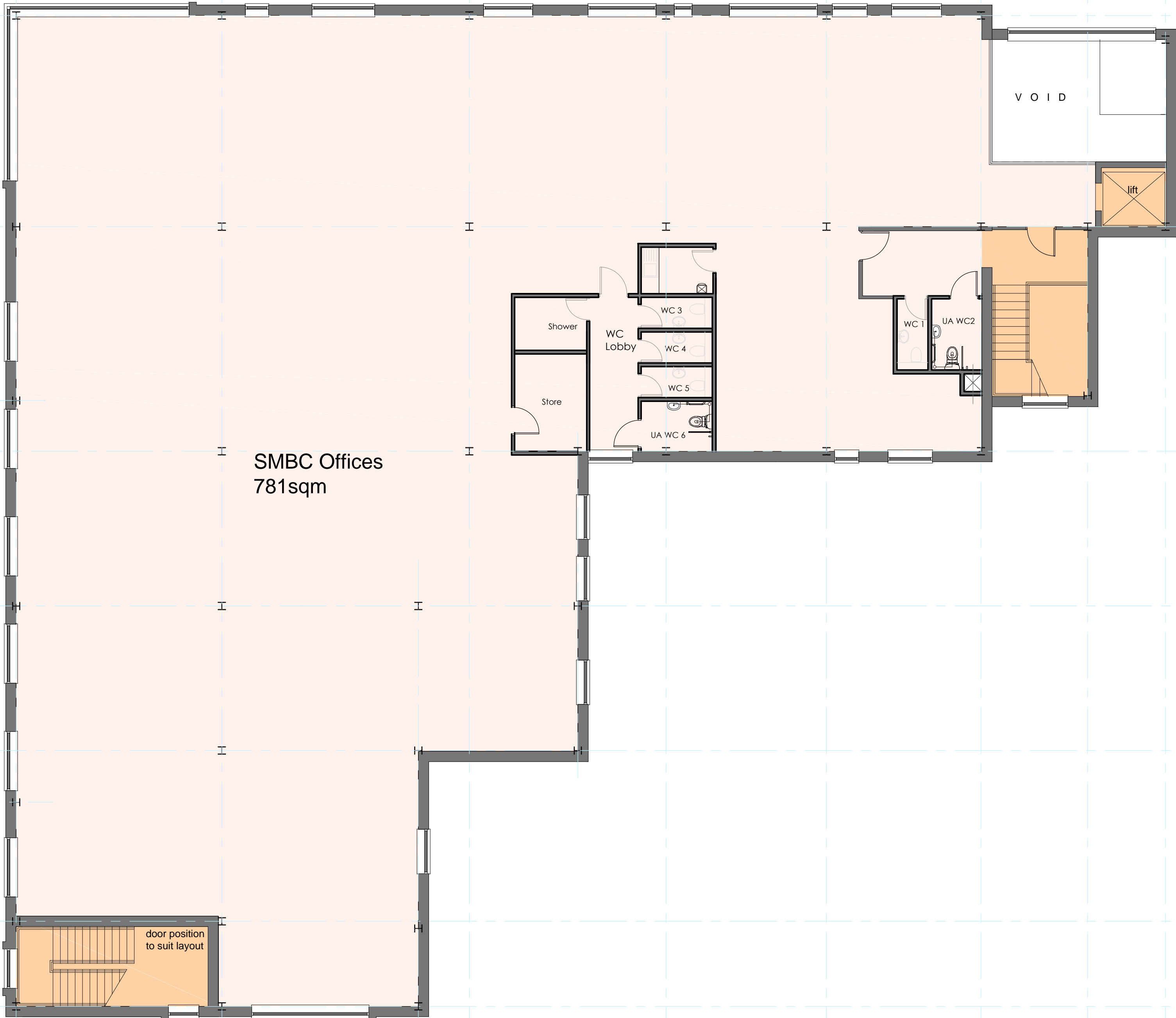
First Floor Plan scale 1:100 @ A1