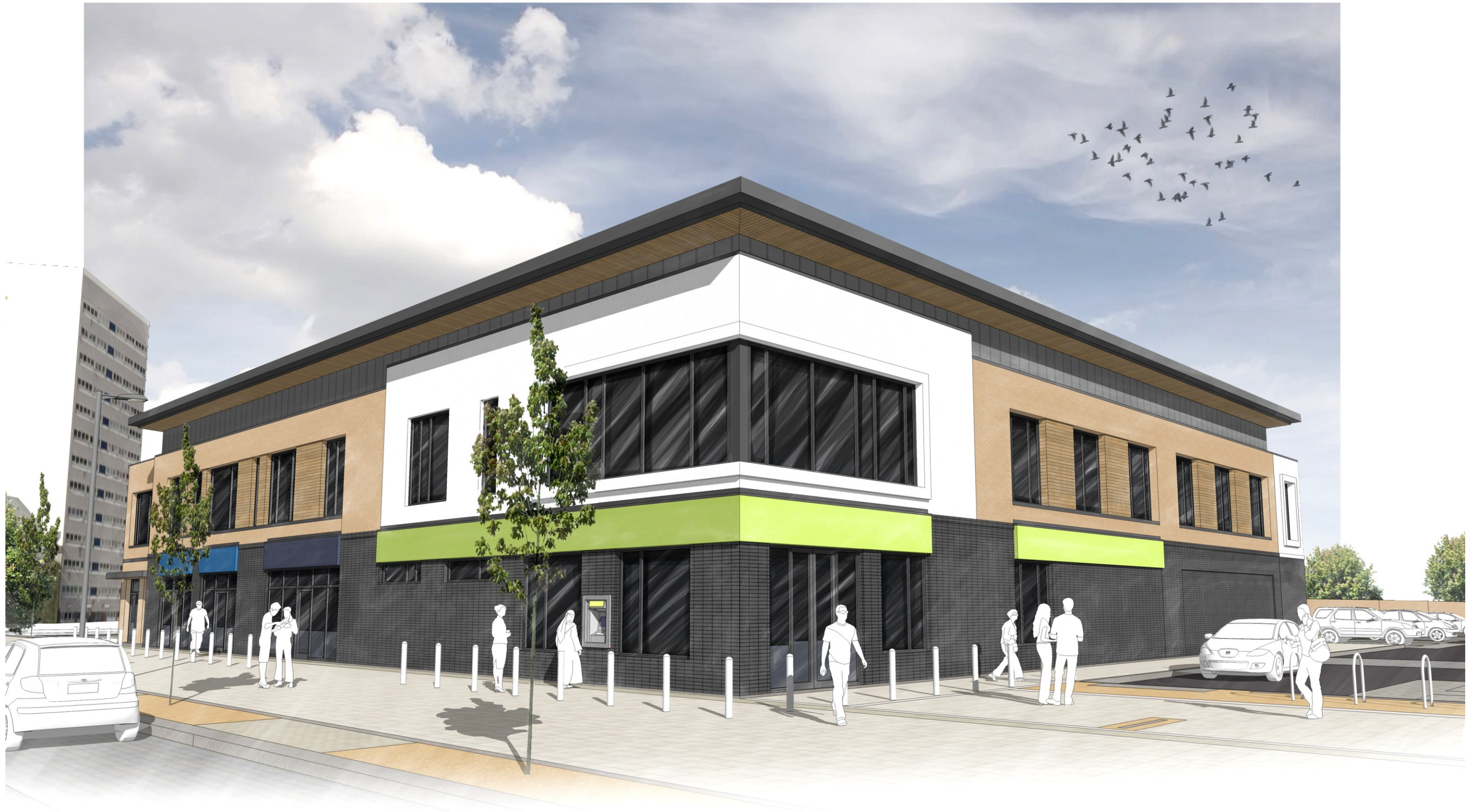
Proposed Mixed Use Development, Chelmund's Cross 1107-301 Proposed Visual from Chester Road (for illustrative purposes only, Totem sign removed for clarity)