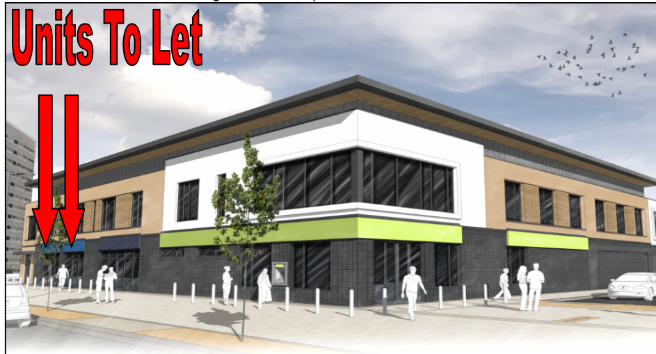
CGI image of new Co-op Food Store under construction

LOCATED AT THE JUNCTION OF CHESTER ROAD AND CRAIG CROFT RETAIL UNITS TO LET WITH CONSENT FOR A1-A5 USES